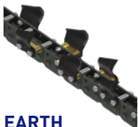
EARTH Soft ground