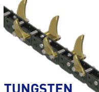
TUNGSTEN Hard ground / Frozen