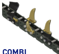
COMBI Mixed terrain