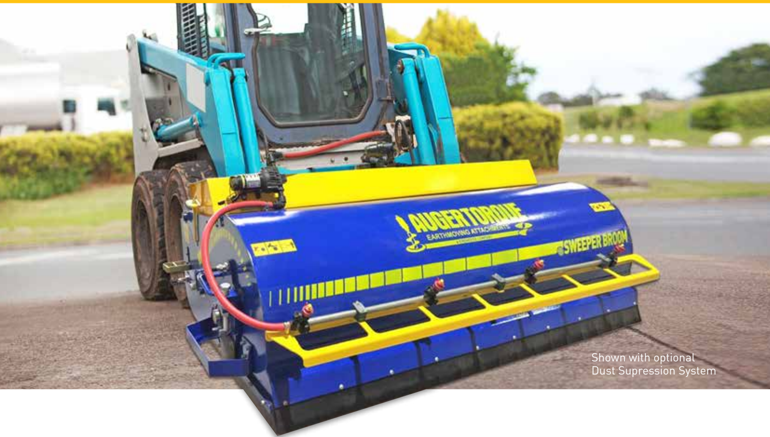
Shown with optional Dust Suppression System